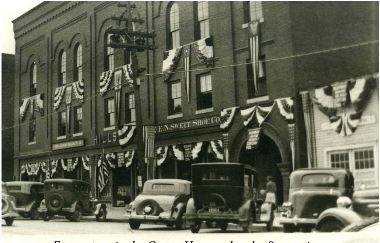
Every store in the Opera House, plus the fire station on the right, displaying their banner over their doors