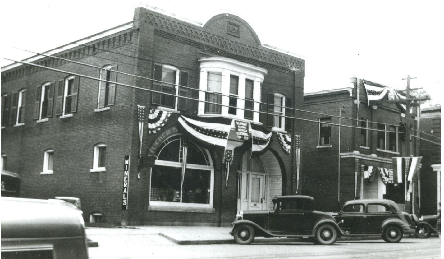
The buildings that are now 290 and 300 Main Street.